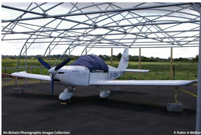
Coonagh based EI-DRW Eurostar in the second club hangar before the roof went on!