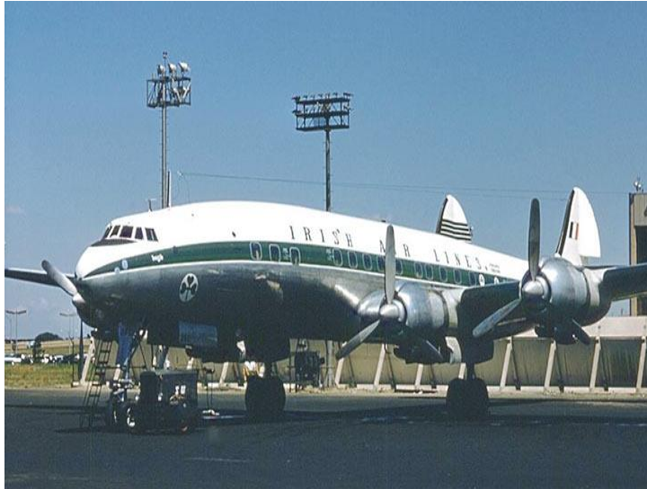
Early photo of Lockheed L1049 of short lived Aer Linte(Irish Air Lines) or Aer Lingus at Dublin circa 1959,.